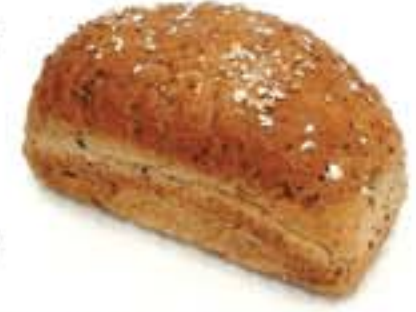
Flour & Glutens

According to the U.S. Department of Health & Human Services, millions of Americans also have allergic reactions to food allergens each year. The reactions can range from mild to severe and can even be life threatening. Since there are no cures for this type of allergy those that suffer from food allergies must avoid exposure.